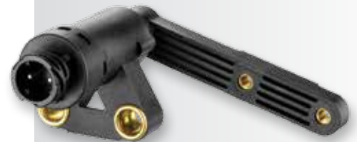
Height Sensor (1)