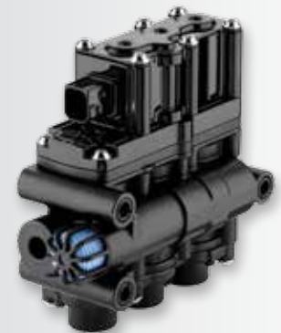
Solenoid Valve (1)