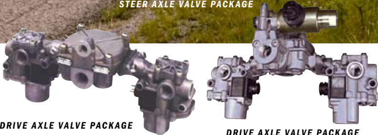
DRIVE AXLE VALVE PACKAGE